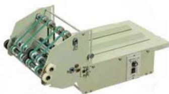
WF-300V, 350V, 385V